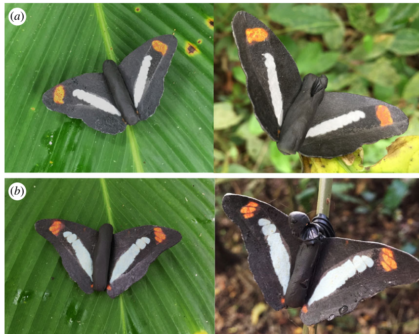
Figure 1. Artificial butterfly models representing (a) A. iphicles , the presumed toxic model, and (b) A. serpa , the putative non-toxic Batesian mimic. Models on the right-hand side show evidence of avian attack, indicated by beak imprints on the plasticine abdomen.

reflectance spectra (for both Costa Rica and Ecuador specimens and models) was determined using tetrachromatic bird-vision models from Vorobyev & Osorio [37]. The comparisons were made using the blue tit ( Cyanistes caeruleus , UV-type), and chicken ( Gallus gallus , violet-type) cone sensitivities (electronic supplementary material, table S1). For chicken, we used the behaviourally determined parameters of Olsson et al. [38], namely, a Weber fraction = 0.06 and relative abundances of cones (VS = 0.25, S = 0.5, M = 1, L = 1). For the blue tit, we followed the work of Hart et al. [39] and used a Weber fraction = 0.05 and relative abundances of cones (UV = 0.37, S = 0.7, M = 0.99, L = 1). High light intensity and Endler's daylight or forest shade irradiance spectra [40] were used. Comparisons were made for white reflectance spectra only, because white is considered an important mimetic feature in other butterfly mimicry systems [41,42], and visual inspection of the reflectance spectra did not reveal any differences between the other wing colours, orange and brown (electronic supplementary material, figures S3–S4).